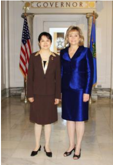
Gov. Fallin (r) with Chinese official, April 2011